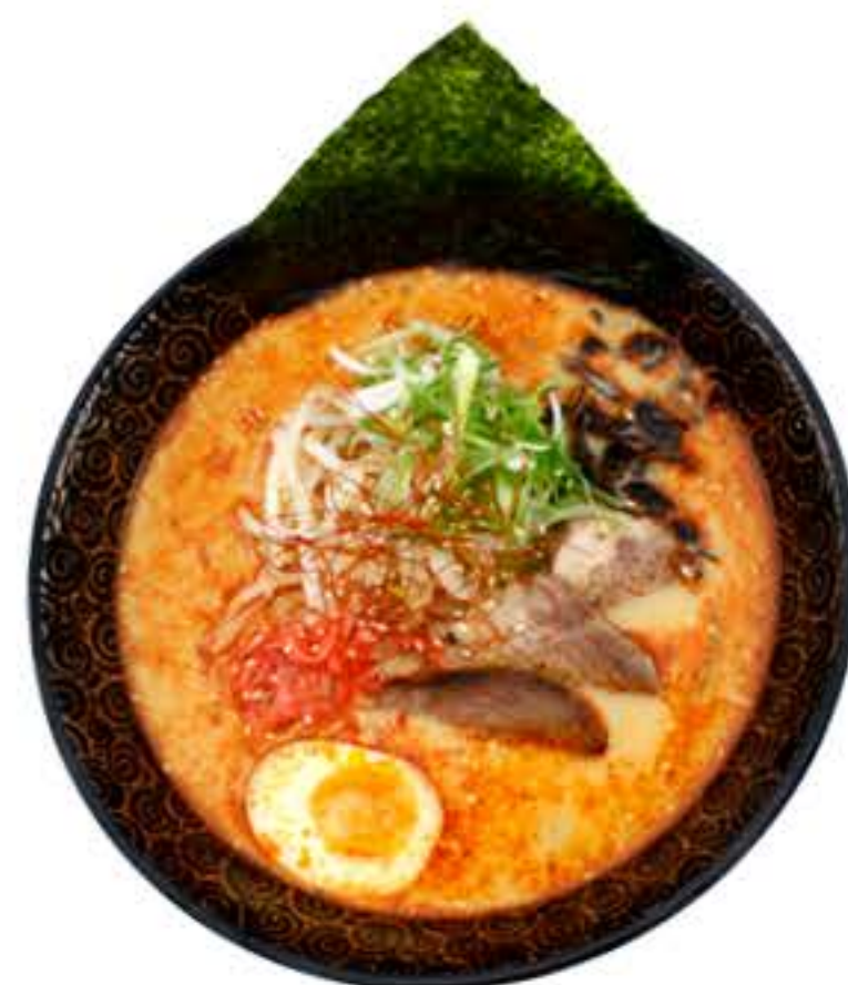
SPICY MISO TONKOTSU 🌶️ $11.99 (680 cal)