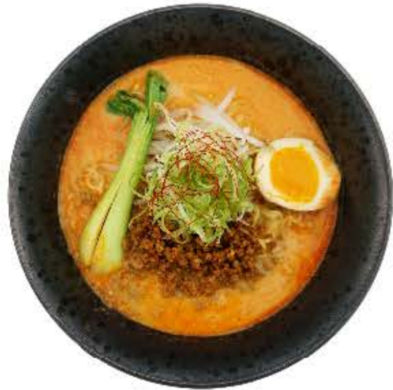
TAM TAM RAMEN 🌶️ $11.99 (910 cal)

WE USE YAMACHAN BRAND NOODLES, FRESHLY MADE IN CALIFORNIA!