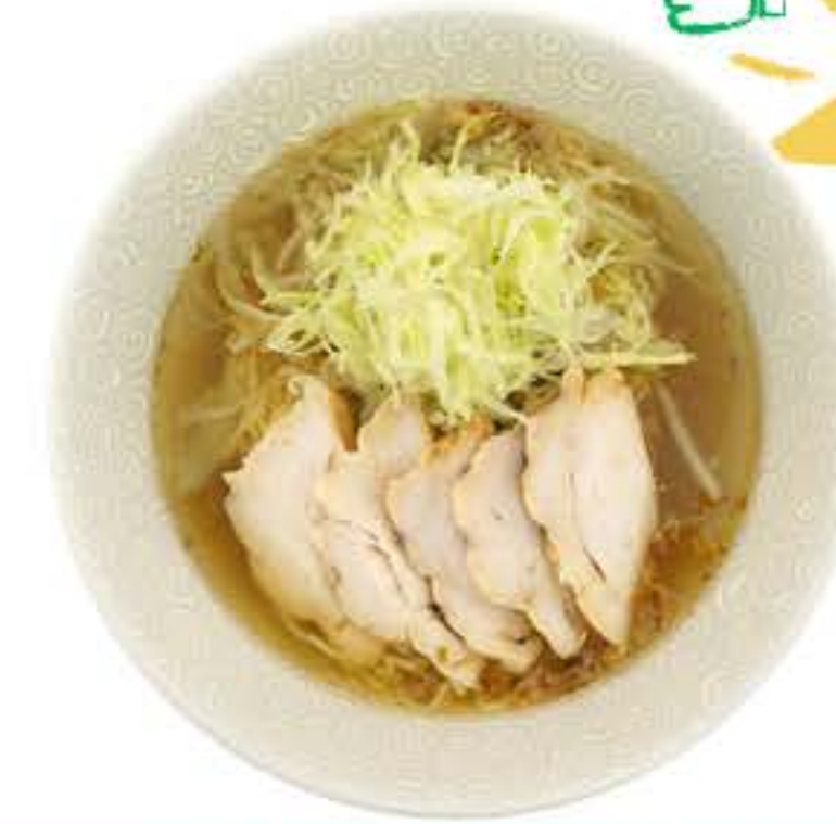
YUZU CHICKEN 😊 $11.99 (640 cal)

YUZU CHICKEN NOW AVAILABLE WITH RICE NOODLES