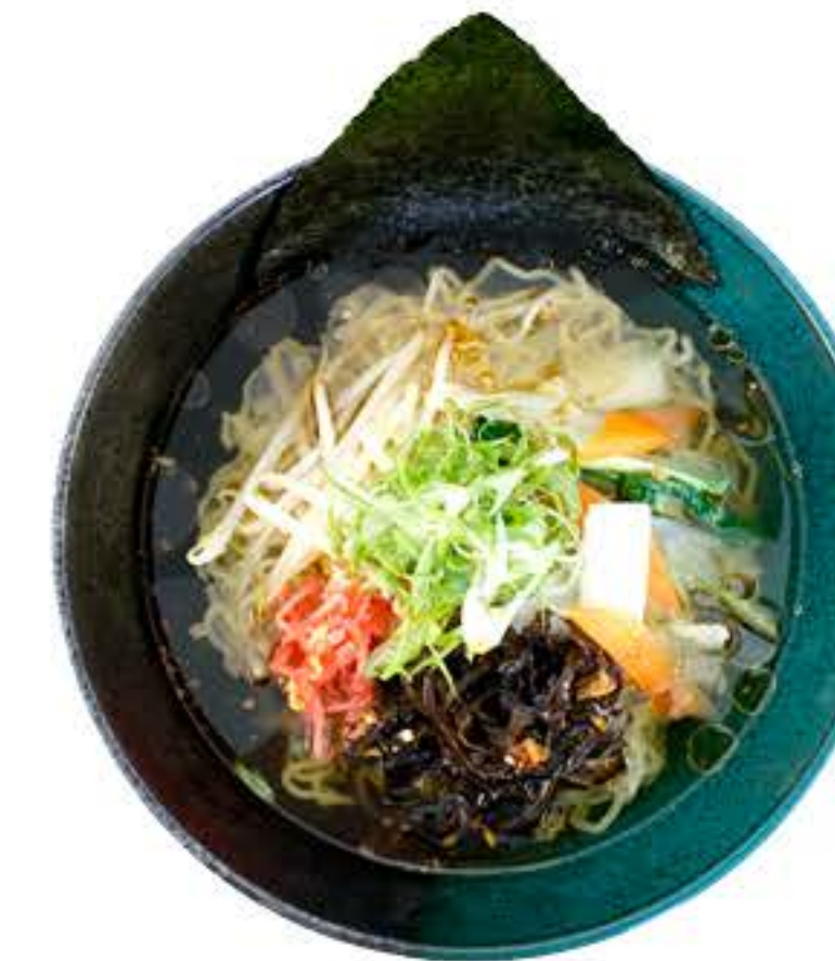
VEGGIE ♻️ $8.99 (590 cal)

WORTH THE WAIT! Our products are made to order. Don't worry, you'll LOVE it!