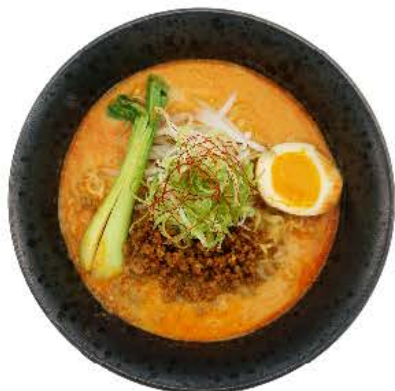
TAM TAM RAMEN 🌶️ $11.99 (910 cal)

WE USE YAMACHAN BRAND NOODLES, FRESHLY MADE IN CALIFORNIA!