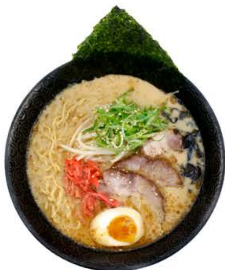
ORIGINAL TONKOTSU $11.99 (710 cal)

YUZU CHICKEN NOW AVAILABLE WITH RICE NOODLES