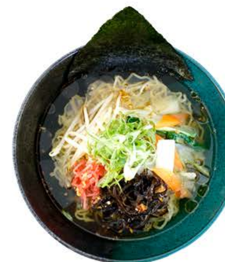
VEGGIE 🌱 $8.99 (590 cal)

WORTH THE WAIT! Our products are made to order. Don't worry, you'll LOVE it!