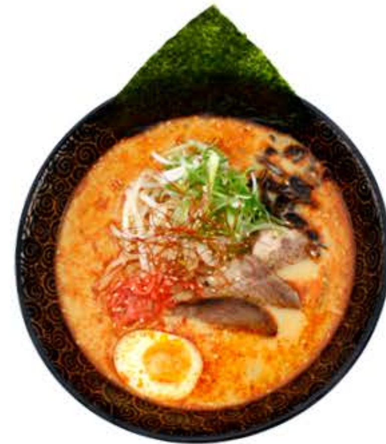
SPICY MISO TONKOTSU 🌶️ $11.99 (680 cal)