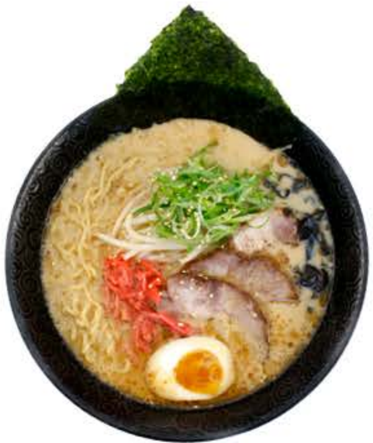
ORIGINAL TONKOTSU $11.99 (710 cal)

YUZU CHICKEN NOW AVAILABLE WITH RICE NOODLES